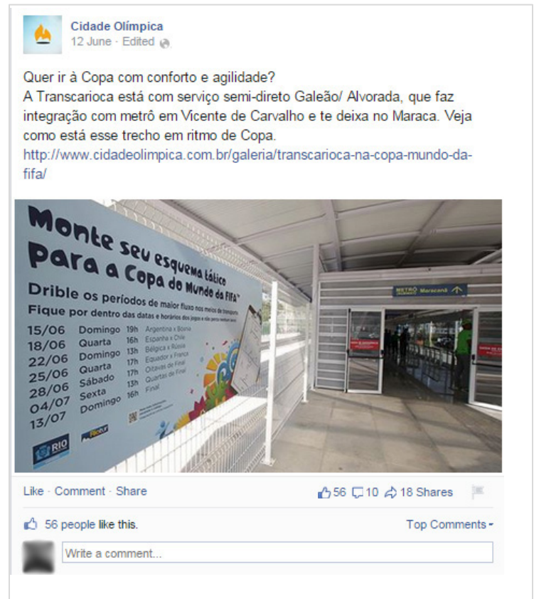
Figure 1: Post on transportation service during match days in Maracanã

Other posts on mobility were identified; one of them was specifically about a free cable car that was installed in a community called Providencia (Figure 2). According to information from the page itself, at least 10,000 people would benefit from this rapid transit service. But, once again, there was no information on accessibility for disabled people on this service.