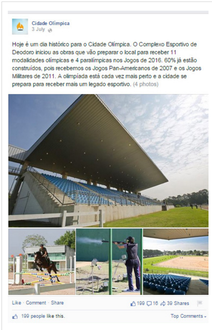
Figure 4: Post on the infrastructure of Deodoro Sport Complex

referral program with two objectives in mind: to extract immediate revenue and to advertise to potential customers.