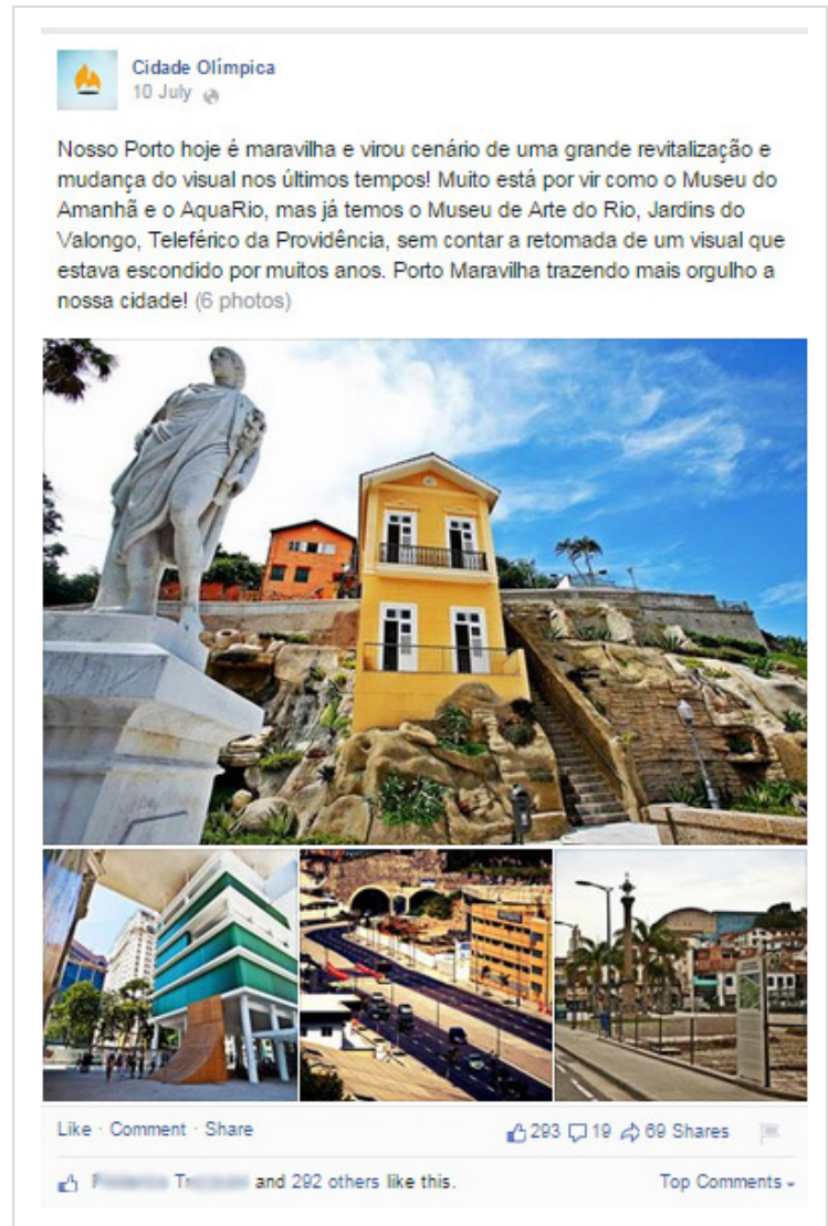
Figure 3: Post on Porto Maravilha recreational area developed in the city

should be a way to promote integration. The lack of discussion of these issues on the page, which has the stated and overt aim of disseminating the legacy of Rio 2016, is a poor reflection of the attitude towards raising awareness of disabled communities as a legacy of the 2016 Games.