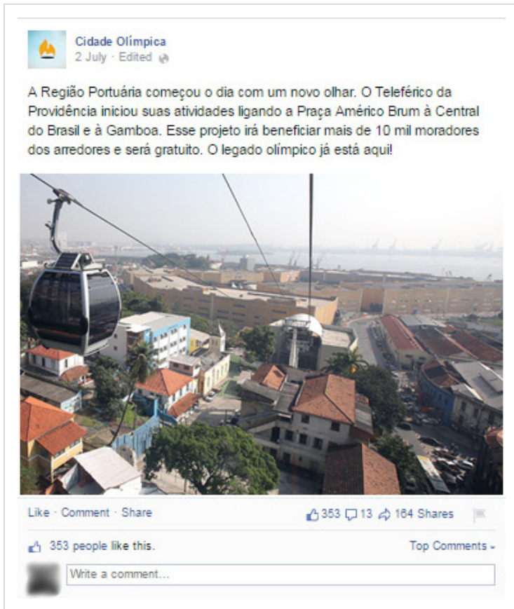
Figure 2: Post on free cable car installed in the Providencia community

The analysis of 'Cidade Olímpica' on Facebook showed no attempt by the Brazilian government to highlight issues relating to disabled people and disability. From the total of 33 analysed posts, there was only one that referenced the issue and, tellingly, this reference was linked directly to the Paralympic Games. There was no reference to the legacy that projects will provide for citizens who have a disability. When it comes to the "Sport-For-Development" discourse, it was restricted to the construction of narratives that exalted great architectural infrastructure, mobility and leisure whilst failing to address issues of equality and access.