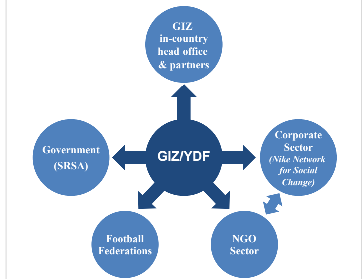
Figure 1. Stakeholder relationships of GIZ/YDF

Collaboration with Nike South Africa (a key strategic corporate partner) was instrumental in forming the Sport for Social Change Network (SSCN). Currently this network has 42 members from Southern African Countries who are co-funded by Nike South Africa and GIZ/YDF for sport for development initiatives. The following diagram displays the stakeholder engagement and positionality of GIZ/YDF, relative to that of SRSA, GIZ in-country head offices, sport federations and the NGO-sector.